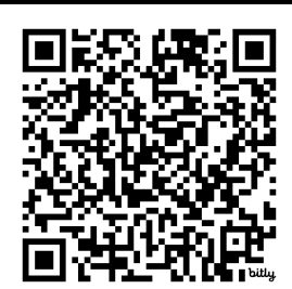
more info & register here